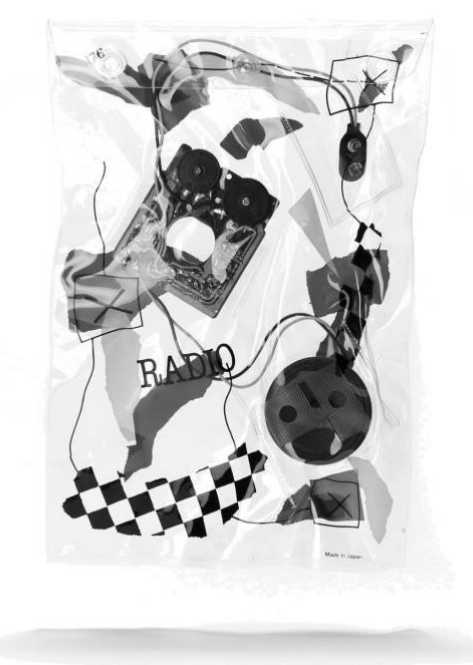
Figure 4: Daniel Weil, Radio in a bag, 1981, aka Hommage à Marcel Duchamp

Similar is the case with Daniel Weil's Radio in a Bag , which is considered one of the most well-known speculative design projects. Consequently, the question arises as to what form a radio should and must have, and what happens when one completely dispenses with conventional values. Weil's radios possess both product design qualities and artistic autonomy. Wolfgang Welsch claims that the miniaturization of microelectronics dissolves the maxim form-follows-function (23). Digital devices have no function per se or can perform different functions (black box): Decoupling of the outer form from the inner product structure (24).