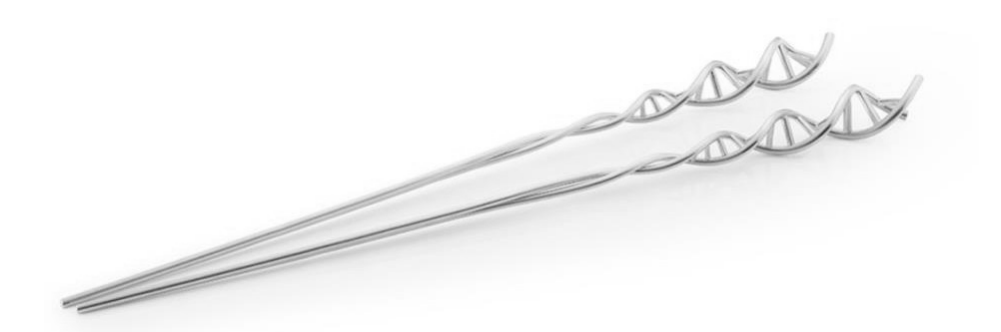
Figure 2: The golden chopsticks – theoretical object from Bazon Brock, (Source: https://www.georghornemann.com/en/collaborations/bazon-brock.html viewed on Nov. 5<sup>th</sup> 2023)

asceticism. The golden chopsticks visualise this principle. If we were to give our golden chopsticks to billions of Asian chopstick users, the sublime treetops of South American primeval forests would not have to fall victim to logging for the production of wooden chopsticks (21).